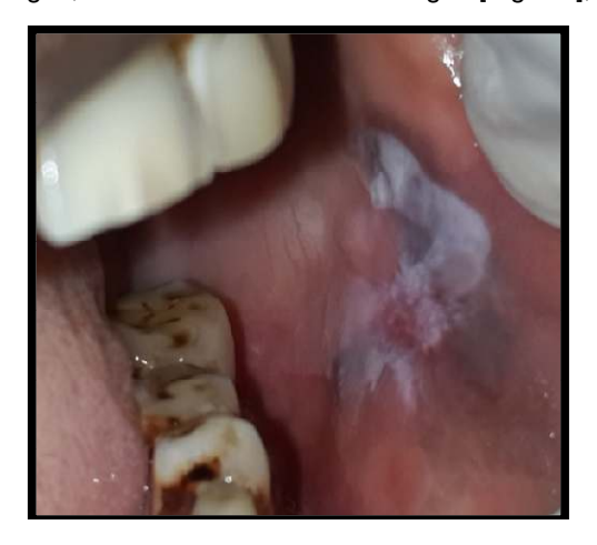
Fig. 1A. Oral leukoplakia on left buccal mucosa

with a configuration including Windows 7 operating system Intel core i3 CPU, and 64 BIT operating system, the digital images were processed and analyzed. 16-bit direct digital images, were converted to 8-bit images [Fig. 2B],