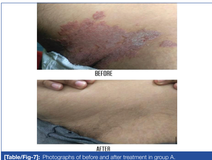
[Table/Fig-7]: Photographs of before and after treatment in group A.

Photographic documentation at baseline and on day 60 is shown in [Table/Fig-7,8].