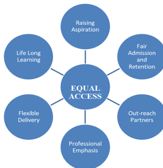
Fig. 2. Typology to measure Equal Access or say Widening Participation at all points of the student life-cycle

Recently, most universities stress on improving the quality of teaching and learning by measuring suggested indicators. Their ability to deliver High Quality Teaching and Learning (HQTL) needs relies on adequate human and financial resources, incentives and rewards efficiently deployed, with governments playing a crucial role in setting incentives, objectives and quality standards for the higher education system as a whole. Recommended future challenges in Higher Education & how to prepare developing countries Ministry of Higher Education like Cameroon for them in achieving widen participation and high quality teaching and learning include: Online learning will have major role; traditional mode still relevant, on the job training – could involve fee, education as a continuous long-term engagement, increased entrepreneurship possibilities, increase learning opportunity for people with disability. Teachers are encouraged to become facilitators of learning and students will have more control of their own learning journey. Classrooms of tomorrow need to focus on a combination of student engagement in learning, enquiry-based approaches, curiosity, imagination and design thinking