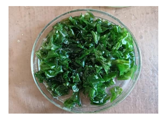
Fig.1. Fresh washed Ulva fasciata algal sample