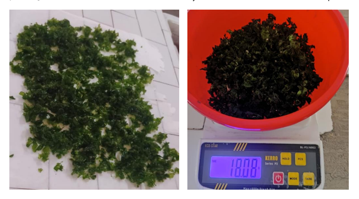
Fig. 4. Ulva fasciata

After 2hrs , samples are taken in a separated funnels by the addition of ether then the organic layer i.e. biofuel which was separated.