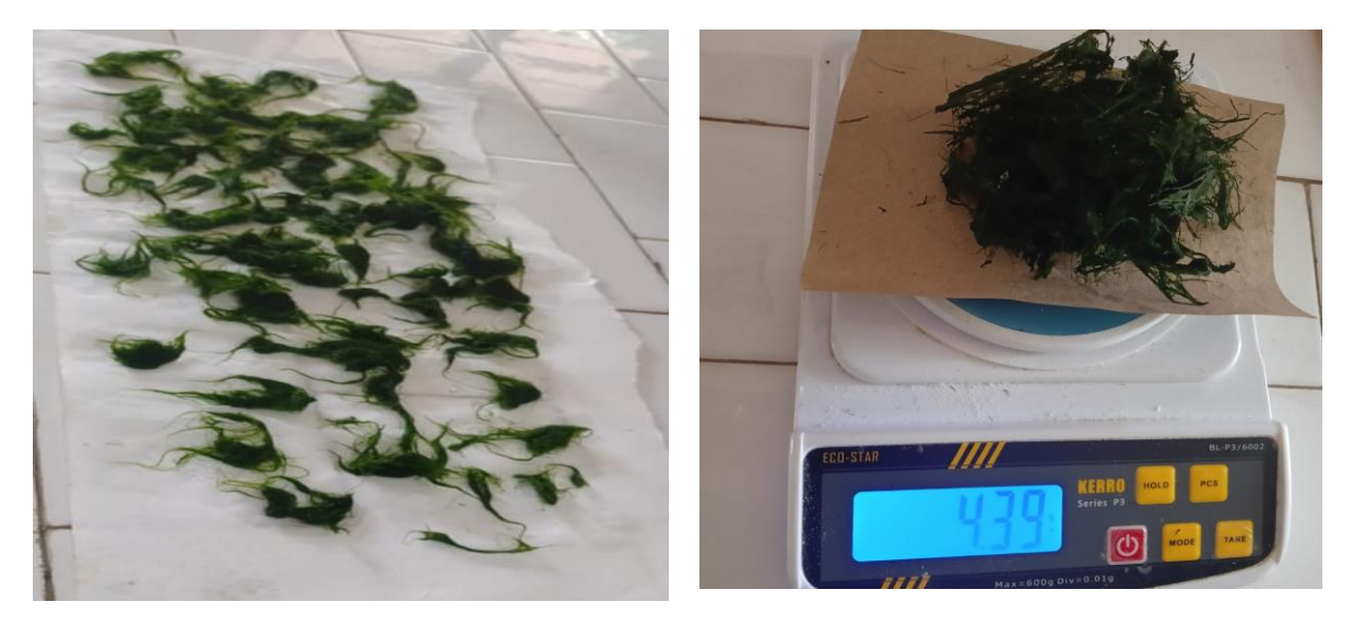
Fig. 5. Chaetomorpha antennina