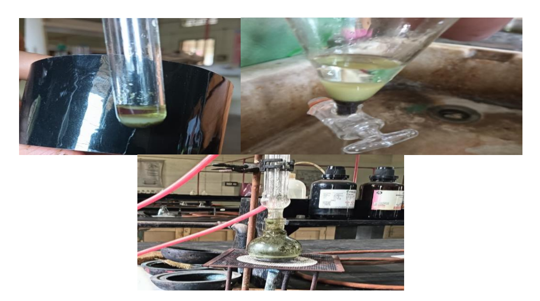
Fig. 6. Biofuel production after processing and evaporation

Prasanthi et al.; Uttar Pradesh J. Zool., vol. 45, no. 6, pp. 94-101, 2024; Article no.UPJOZ.3328