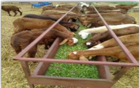
Fig. 2. Sheep feeding in manger

roughage feed supply was the major contributor as a feeding source for sheep in intensive but in case of extensive system fodder was the major feed resource. Most of the sheds were having natural ventilation with minimum per cent of sheds having fans provision in intensive rearing whereas in extensive system all the pens were having natural ventilation. These results were in competence with the outcomes of Appannavar et al. [17], Gowane et al. [15].