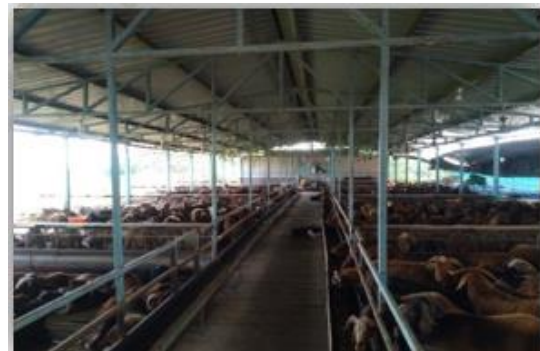
Fig. 5. Sheep in closed shed