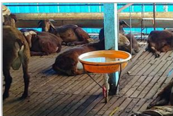
Fig. 6. Trough water for sheep in shed