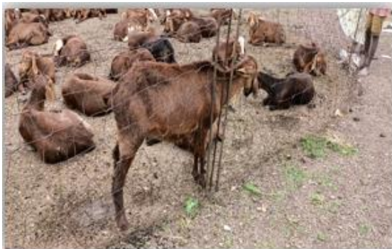
Fig. 4. Sheep in open fence