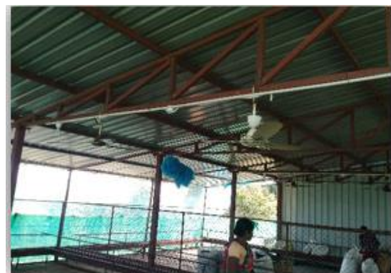
Fig. 7. Fan ventilation in sheep shed