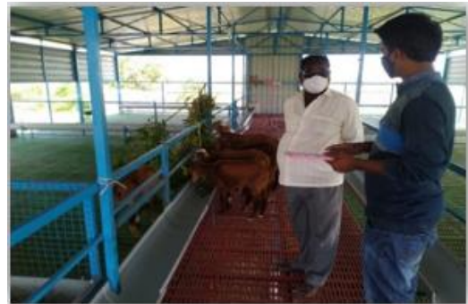
Fig. 3. Galvanized roofing with slatted flooring