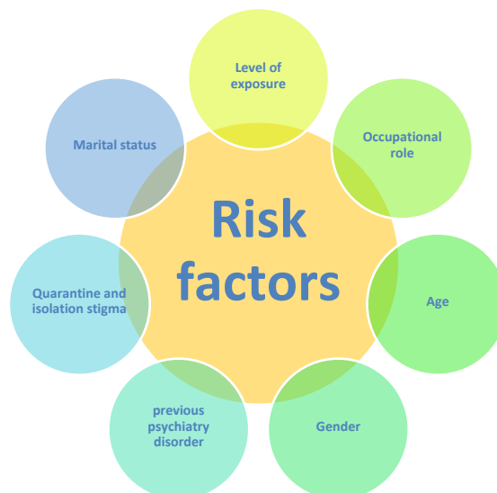
Fig. 2. Risk factors for COVID 19