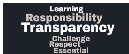
Image 1. List of words

To complement the answer to the last question of the interview, a visual representation of the words provided by the interviewees was made, forming from a free evocation of words. Three of the institutions, as they do not have the Disclosure process active, refrained from conceptualizing. In this question, six words were mentioned, namely: Transparency (3 mentions), Responsibility (2), Challenge (1), Respect (1), Learning (1), and Essential (1), as you can see below: