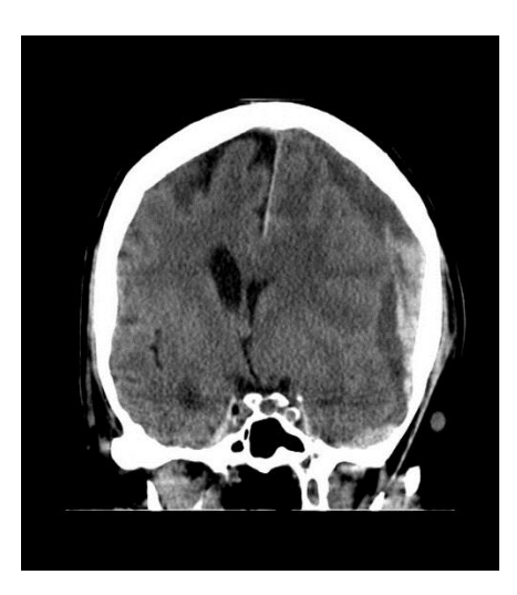
Fig. 1. Subdural hemorrhage

Treatment was administered with FFP and cryoprecipitate, along with inhibitor eradication using oral prednisolone at a dose of 1 mg/kg/day. A positive response was observed, with a reduction in bleeding, and the patient was discharged after five days of treatment. Prednisolone was gradually tapered over a twoweek period. No further bleeding episodes occurred, and a follow-up clot solubility test performed three months later yielded a negative result. The patient remains asymptomatic to date.