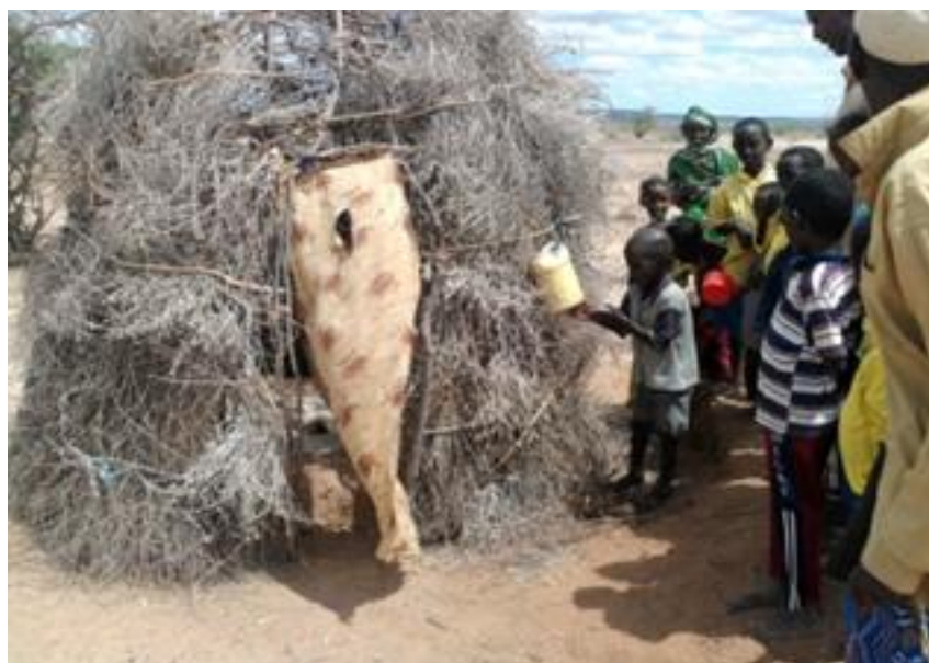
Fig. 2. WHO figures in which shared facilities stand at 51% for Urban and 18% for Rural in Kenya