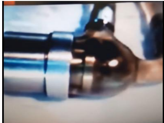
Fig. 1. Exhibition of a permanent maglev LVAD

Since early 1980s, the author began to develop a Chinese rotary pump. After solving successively the problems of implantability, blood compatibility, pulsatility, reliability, etc, the bearing durability became the main question. Realizing that the electric magnetic bearing needs rotor position detect and feed-back control, which makes the device complicated and very expensive, the author insisted to develop a permanent magnetic bearing. Both axial and radial bearings were used in LVAD device (Fig. 1) [1], and then in a earlier developed impeller TAH (Fig. 2) [2,3,4].