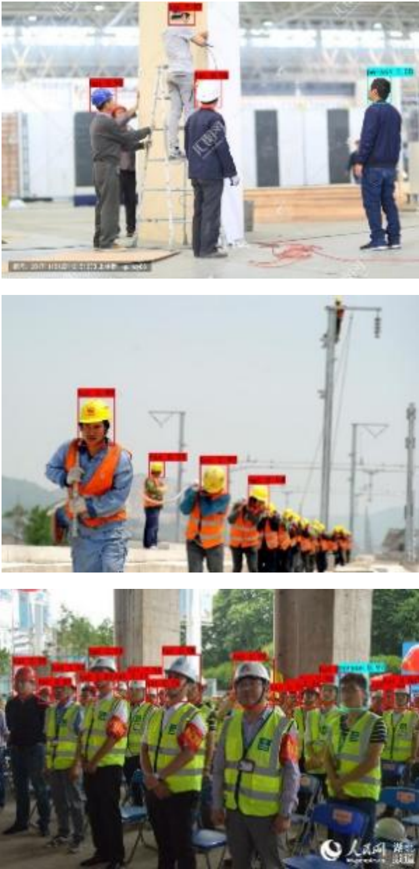
Figure 3. YOLOv4 mobileNetv3 detection result.