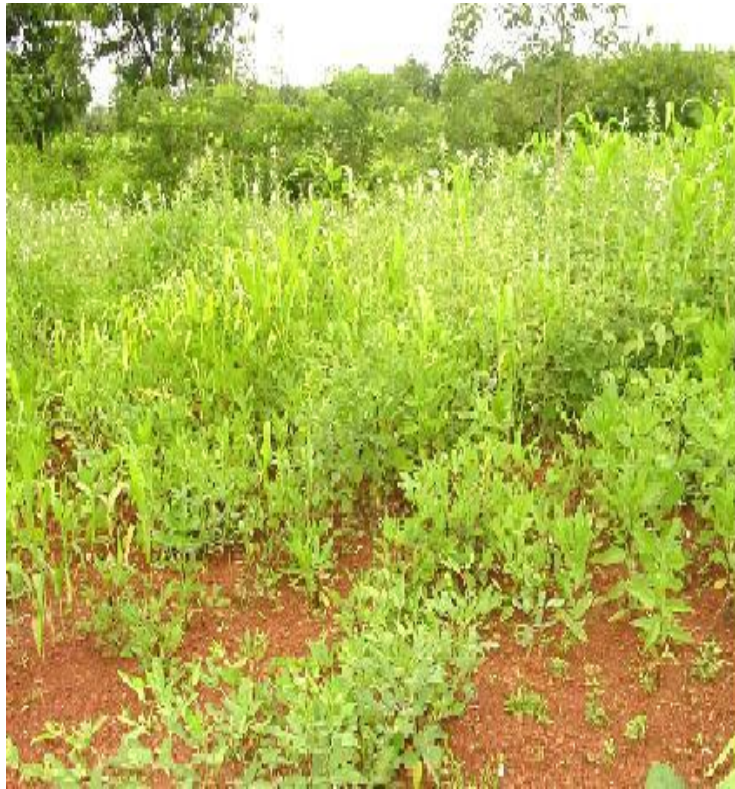
Plate 2. Mixed cropping cultivation