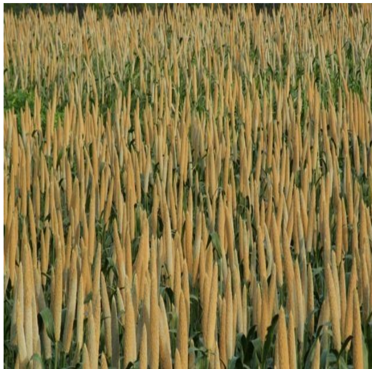
Plate 3. Millet cultivation