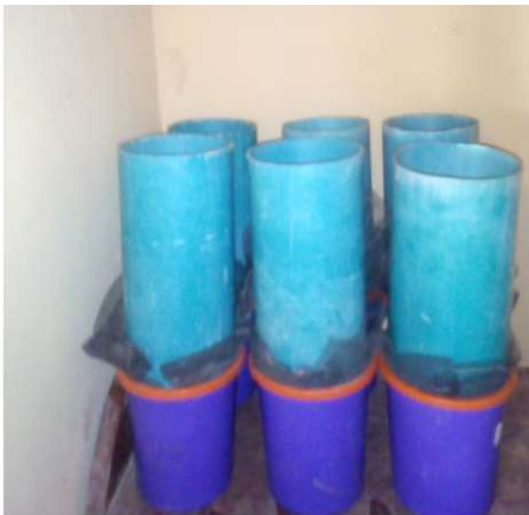
Plate 1. Leaching column set up made from polyvinyl chloride.

three weeks after planting and three more times, during flowering and pod formation (8, 9 and 10 weeks after sowing) stages. The cowpea was nurtured to maturity.