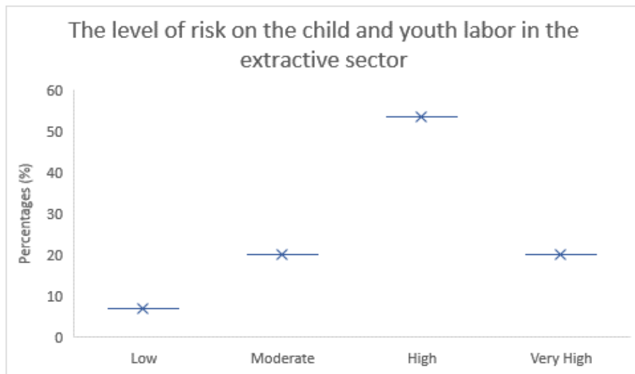
Fig. 2. The level of risk on the child and youth labour in the extractive sector