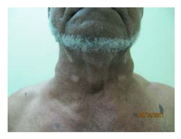
Fig. 1. Bilateral cervical lymphadenopathy seen

British Journal of Medicine & Medical Research, 3(4): 1634-1645, 2013