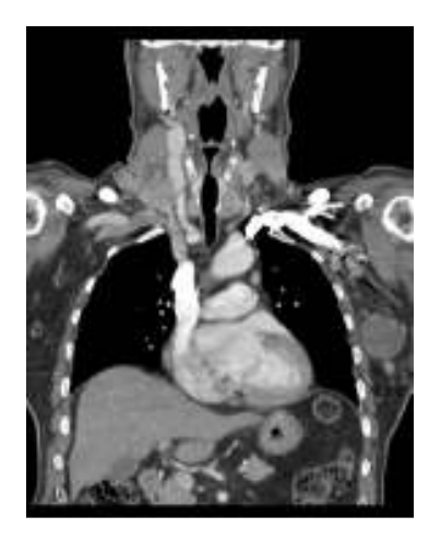
Fig. 3. CT scans revealing bilateral cervical and left side axillary nodal metastasis

British Journal of Medicine & Medical Research, 3(4): 1634-1645, 2013