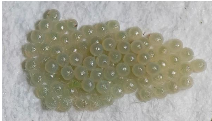
Fig. 2. Egg mass of Spodoptera frugiperda viewed under a stereomicroscope

Further, in lepidopteran insects, materials from spermatophores are known to contribute to egg production and somatic maintenance [5,6]. The increased egg production in multiple-mated females may be attributed to the nutritional benefits and hormonal effects associated with additional matings. For example, higher concentrations of vitellogenin, which is controlled by juvenile hormones, have been observed in mated females, further supporting the role of multiple matings in enhancing reproductive output [26].