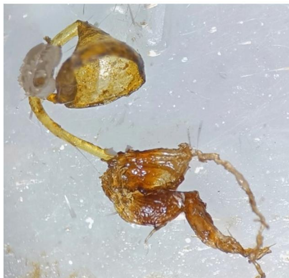
Fig. 1. Used spermatophore dissected from the bursa copulatrix of a female moth after its death, observed under a stereomicroscope

Egg laying was observed exclusively during the scotophase, with no activity recorded in the photophase. Females began laying eggs in the early hours of the scotophase, with the highest frequency of egg deposition occurring on the third scotophase and continuing through to the tenth (Fig. 2). The observed fecundity in multiple-mated females ranged from 803 to 2020 eggs, averaging 1468.6 \pm 124.04 . In contrast, single-mated females produced between 520 and 1290 eggs, with an average of 858 \pm 53.36 (Fig. 3). These findings suggest that multiple mating may enhance fecundity, potentially due to the replenishment of sperm and acquisition of additional nutrients, which can contribute to increased egg production [7,8,3].