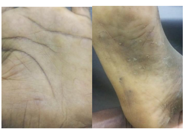
Fig. 1. Syphilitic roseola on palmar and plantar areas

After two months of monitoring, the patient's clinical evaluation was normal, and the biology revealed 24-hour proteinuria at 140mg/24h (0.09g/l), serum albumin at 40.1g/l, total proteins at 70g/l, and creatinine levels were still normal. The evolution of proteinuria and syphilis antibody monitoring are shown in Table 1 and Fig. 2.