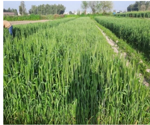
Fig. 2. Wheat Crop at 90 days after sowing

sowing (75%RDF+Zinc Spray @ 15 + 30 + 60 DAS). In the previous studies also, it has been observed that wheat crop is affected by foliar spray of two doses of ZnSO_4 , 0 ppm and 10 ppm pot^{-1} . Their results also showed that with a foliar spray of 10 ppm ZnSO_4 is effective in increasing the plant height and number of tillers hill^{-1} than the control [13]. Another study also revealed that ZnSO_4 \cdot 7H_2O ( 200 g ha^{-1} ) foliar application resulted in the greatest significant increase in plant height (104.02cm), dry material (179.64 g), and chlorophyll content (47.46) in wheat crop when compared to 0 and 100 g ZnSO_4 \cdot 7H_2O at 60DAS [14].