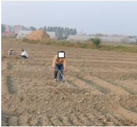
Fig. 1. Preparation of field for the sowing of wheat crop