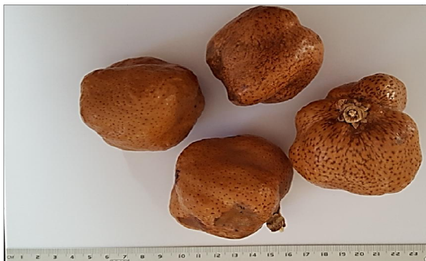
Fig. 1. Fruits of Hyphaene thebaica L. (Doom)