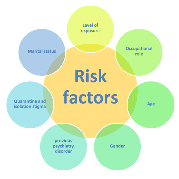
Fig. 2. Risk factors for COVID 19