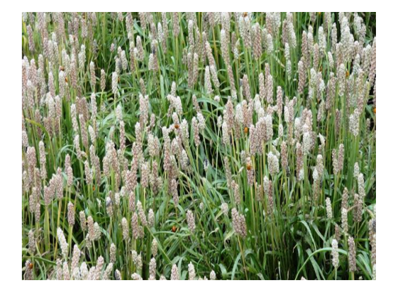
Plate 1. Psyllium plant (Plantago ovata)

Plantago ovata mucilage has an extended history as a nutritious addition due to its considerable extent of insoluble and soluble fiber being described as a pharmaceutically active gel forming natural polysaccharide, effectively used for the treatment of diabetes, high cholesterol, obesity in kids, remediation of diarrhea, constipation, ulcerative colitis and inflammation bowel diseases [8]. While, it's functional benefits, there are few reports about the combination of Psyllium in manufacturing foodstuffs [9] in developed countries Psyllium seed consumption essentially results from the intake of capsules and other dietary preparations. Psyllium is worldfamous as a laxative, is a potential source of nutritious enhancement and has important biological antioxidant and anti-inflammatory properties [10,11]. Plantago ovata seeds comprise in 65% insoluble polysaccharides (lignin, cellulose and hemicellulose) and 35% of soluble fibers. The seeds comprise xylose, arabinose, rhamnose and galactose. Also, they verified that the polysaccharide of Plantago ovata husks can be used as a disintegrating agent in the improvement of fast-dissolving tablets [12]. The presence of mucilage's is on the level of 20-25% [13]. Plantago ovata psyllium is a source of natural and concentrated soluble fiber derived