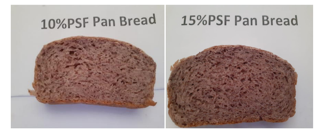
Fig. 2. Pan bread formulas enriched with PSF

The differences in the color of pan bread enriched with PSF resulted from two reasons. The first and dominant was the color of the PSF, which was characterized by a greyish shade and strongly affected the overall color of the dough and breads. This was also noticed by the panelists. On the contrary, when comparing the chemical composition of WF and PSF it was indicated that the WF was characterized by a higher protein content, which had a significant influence on the Maillard reaction during baking.