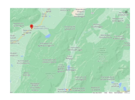
Fig. 1. Study area map, Vellore, Tamil Nadu, India