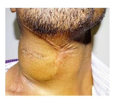
Fig. 5b. Flap reconstruction (Follow up)