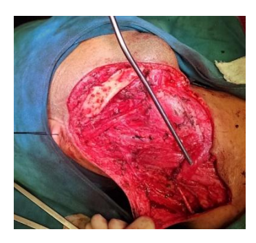
Fig. 3. Per operative