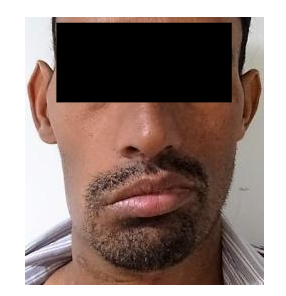
Fig. 8. Folow up (6 months)- Right facial nerve paralysis

Fine needle aspiration cytology is a valuable tool for diagnosing a parotid gland swelling with high specificity (97%) [3].