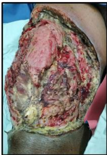
Fig. 1. At presentation, necrotizing wound with extensive slough

On arrival, the patient was febrile, tachycardic and in altered sensorium. He had a large irregular 25 x 15 cm wound over the anterior aspect of right thigh, with exposed and necrotic anterior compartment muscles, and extensive slough (Fig. 1), with cellulitis extending from the groin crease up to the knee without any evidence of arterial insufficiency. Laboratory investigations showed marked leukocytosis with left shift, hyponatremia and deranged renal function parameters. An X-ray of the lower limb was done, which showed no involvement of the underlying bone, and showed subcutaneous air.