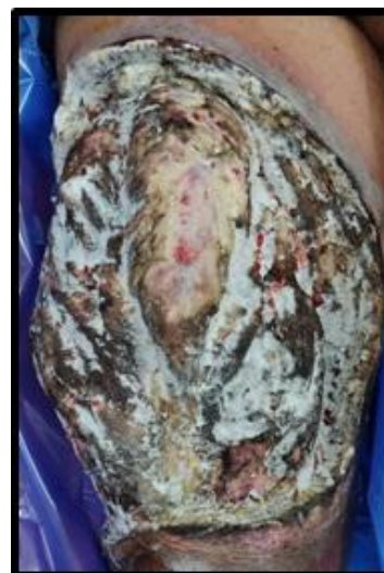
Fig. 3. Postoperative day 1, showing extensive cottony growth