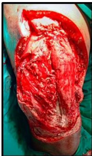
Fig. 2. Post debridement, wound appearing healthy