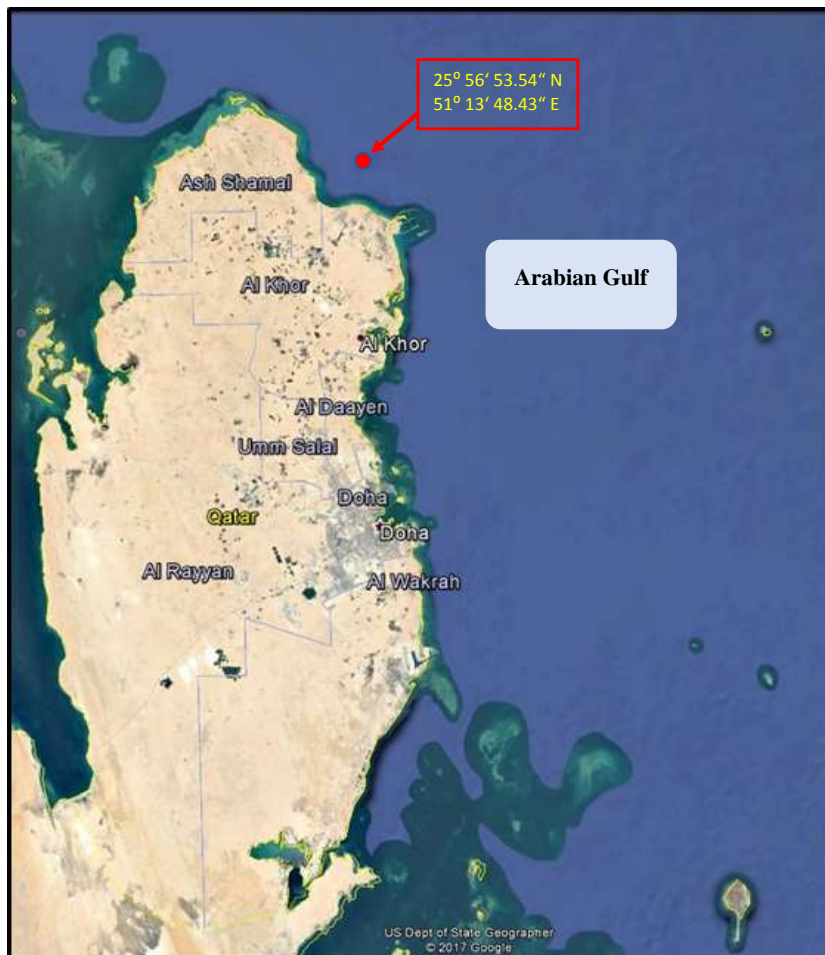
Figure 2. Map of Qatar.

the annual mean air temperature is 27°C, and the average annual free water evaporation ranges from 1750 to 2150 mm. The average minimum temperature of 22°C is attained in January, and the average maximum of 47°C is reached in July. Thus, the area has a desert climate with cool winters and hot dry summers. The average annual precipitation is 81 mm, and the rain falls normally during the winter and spring months (November to April).