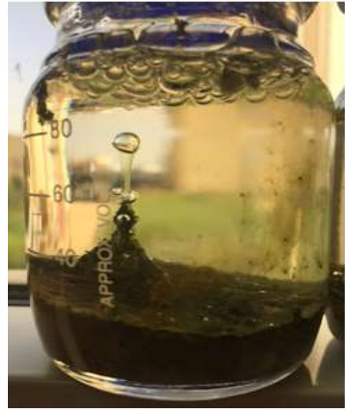
Figure 7. Cyanobacteria grew after soils were transferred to the laboratory, the mixture of soil and sterilized distilled water was left under natural light and temperature for 3 to 4 weeks. Some produced a biofilm on the inner surface of the glass bottle, producing bubbles of oxygen.

colonies that displayed different morphologies such as off-white, orange-red or cream colors, non-circular colony shapes, and mucoid textures were chosen. Microscopic examinations revealed that cells of isolated strains were Gram-positive rods with pointed ends that occurred singly, in pairs, or in short chains. In fact, most isolates belonged to the genus Bacillus ; they were rod-shaped, Gram-positive, non-spore-forming long bacteria (Figure 5) isolated from 2MNA incubated at 60°C for 2 days. Some were spore-forming (Figure 6), and almost all strains formed endospores after growth on NA at 60°C. Spores were ellipsoidal or sometimes spherical (0.7 to 1.5 µm in diameter) and were located at a central to subterminal position. The frequency of spore-forming