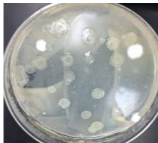
Figure 4. Thermophilic bacteria cultured using nutrient agar and incubated at 60°C. The white colonies are thermophilic Streptomyces , which predominate in desert soils.