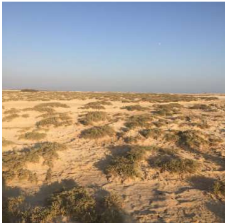
Figure 1. Part of the study site, northeast of Qatar.