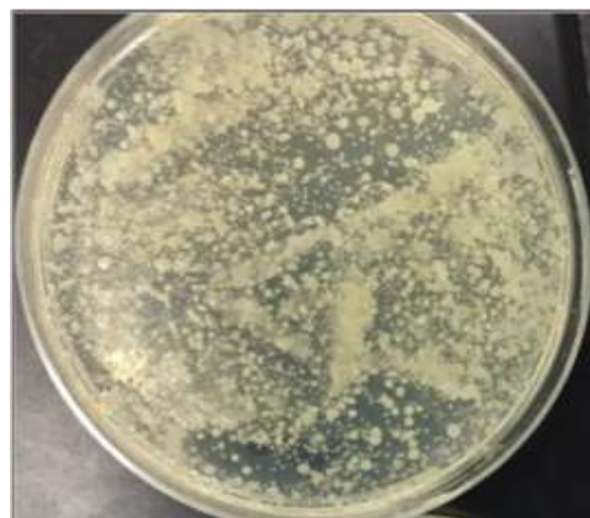
Figure 3. Culture of halophilic bacteria grown in nutrient agar in 2 M NaCl at 35°C.

The bacterial cultures shown in Figures 3 and 4 indicate that colonies of most strains were 1 to 2 mm in diameter, circular, smooth or mucoid, slightly raised and non-pigmented. However, some pigmented colonies were found in halophilic cultures incubated at 35°C. Selected isolated colonies were characterized by Gram stain, shape and morphology, and were observed using a light microscope. To obtain a diverse assortment of isolates,