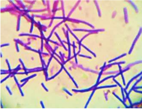
Figure 5. Gram positive bacilli, non-spore-forming long bacteria isolated from nutrient agar in 2 M NaCl after incubation at 60°C for 2 days. Magnification 1000x (scale, 10 µm).